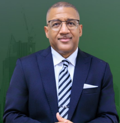
EXECUTIVE PASTOR'S PEN

Greetings my beloved Brothers and Sisters in Christ! As many of you are aware, we are in our annual month of sabbatical. Let's explore exactly what that means, after all Jesus, Himself, took time for a sabbatical. The term sabbatical originated from the Greek word "sabbatikos" or pertaining to the Sabbath. This, in turn, is derived from the Hebrew word "shabbath", which means rest, and finally the Latin origin, "sabbaticus" is derived from the Greek "sabbatikos".