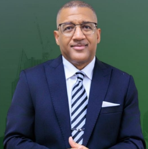
EXECUTIVE PASTOR'S PEN

Do you know that there are Dangerous Duties of Discipleship? Yes! Absolutely there are! Discipleship is not for the faint of heart, and the work of discipleship must come from the heart. In fact, discipleship requires courage and undeniable forthrightness.